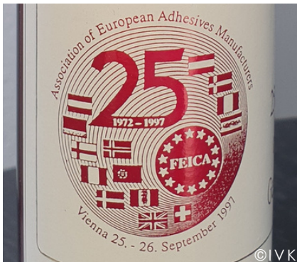
Bottle of wine commemorating 25 years of FEICA, courtesy of industrieverband klebstoffe (IVK)